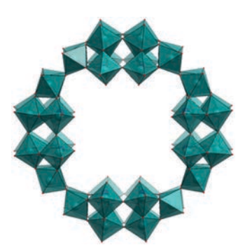
Fig. 3 Polyhedral structure of the tetrameric [Se_8W_{48}O_{176}]^{32-} wheel. (Colour code: \{Se_2W_{12}\}\ units = teal polyhedra. Cations and water molecules have been omitted for clarity).